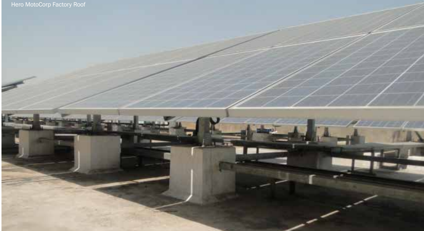
Solar PV Panels Installed on Hero MotoCorp Factory Roof

Several state and city programs are adopting rooftop solar policies. For example, the state of Gujarat allocated 5 megawatts (MW) of rooftop PV systems under its Gandhinagar Solar Rooftop Solar PV project and has announced plans to allot an additional 25 MW in five cities across Gujarat. 5 And policies are not limited to commercial applications. Tamil Nadu, for instance, announced a residential rooftop solar scheme under which the first 10,000 consumers to set up 1 kilowatt (kW) systems will get a subsidy of Rs 20,000 from the state government, in addition to the central government subsidy of Rs 30,000. New Delhi and other municipalities are also considering programs.